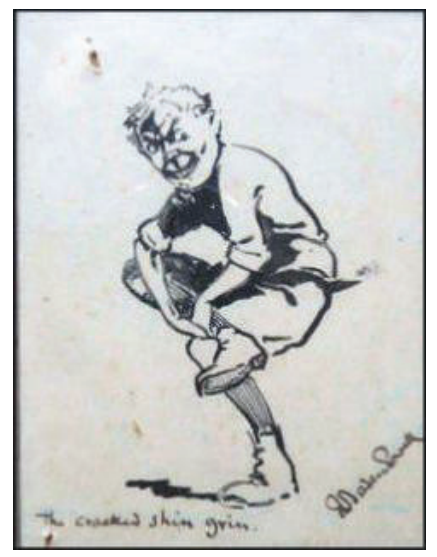
The cracked skin grin £633