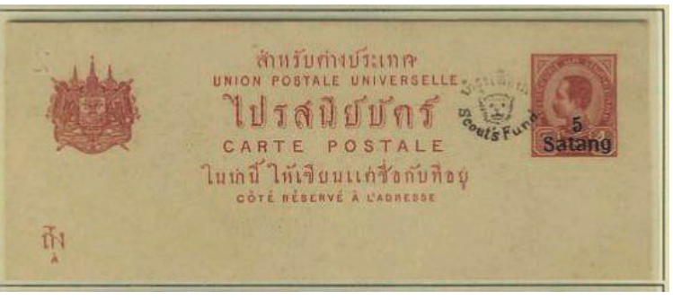
A rare 'Tiger Head' postcard (Type II).

stamps and postcards were withdrawn from