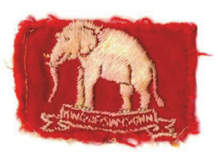
An early Group Badge