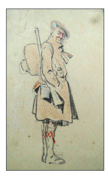
Scottish Soldier £330